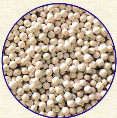
▲ MOLSIEVE 4A-SP in Spheres form