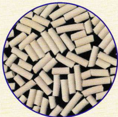
▲ MOLSIEVE 4A-SP in pellets form