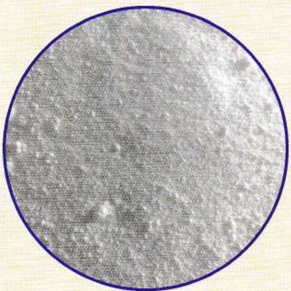
▲ MOLSIEVE 4A-SP Powder